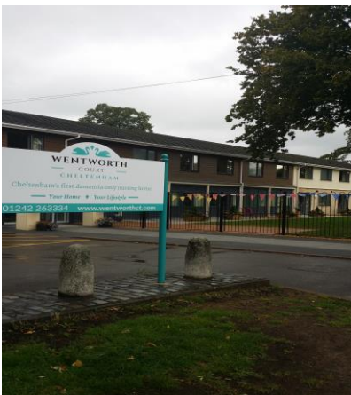
Wentworth Court Nursing Home

"The software also came loaded with all of the assessments we could possibly need. There was choice. Our choice. We are a growing company and long term as we acquire new sites, we wanted a system which would allow for easy transference of our operational procedures and templates. Abylss CMS offers us this potential"